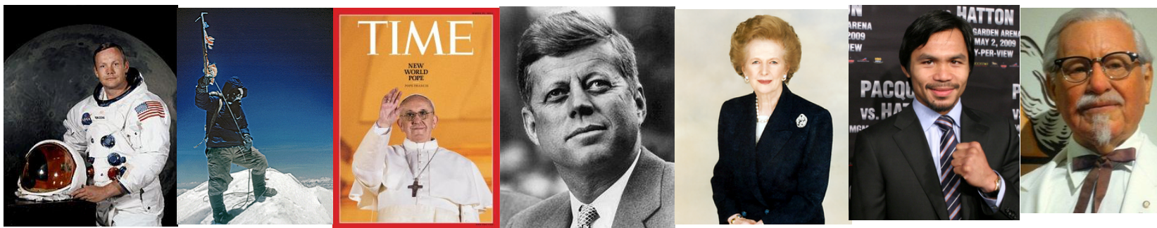
From left to right: Neil Armstrong, Sir Edmund Hilary, Pope Francis, John F. Kennedy, Margaret Thatcher, Manny Pacquiao, and Colonel Sanders.